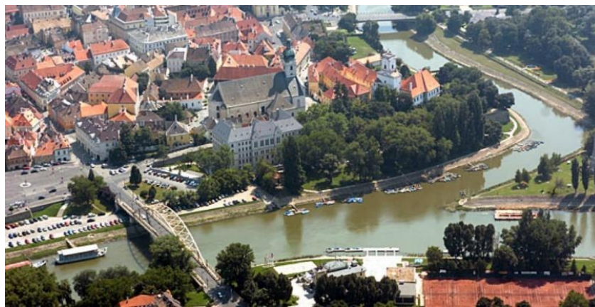
The City of Győr