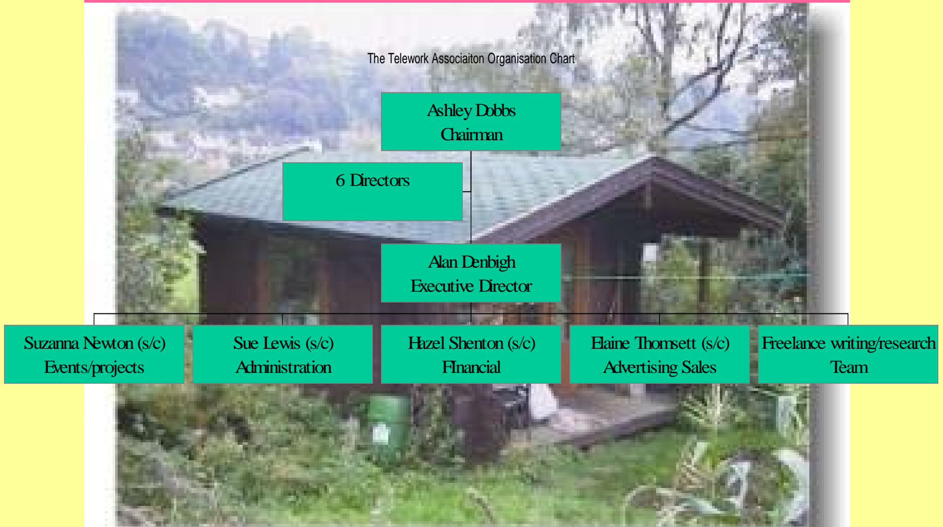
The Telework Association Organisation Chart