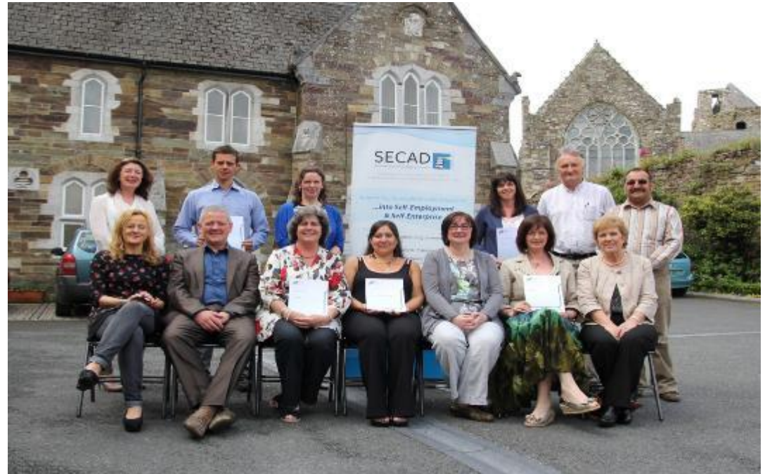
Group of AIR 2 graduates in Youghal

Delivered by SECAD in partnership with Department of Social Protection (DSP)