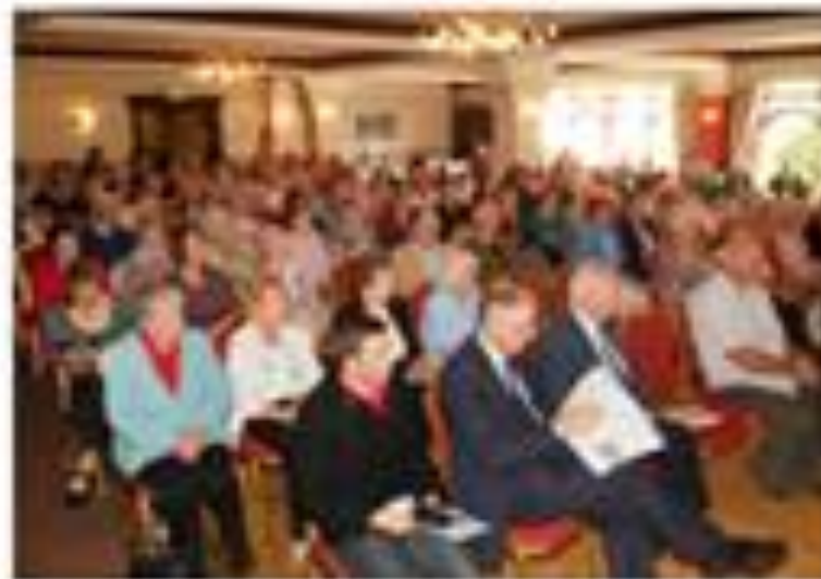
SECAD Rural Transport